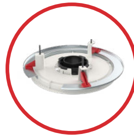
TCM-X-FM Flush Mount Kit