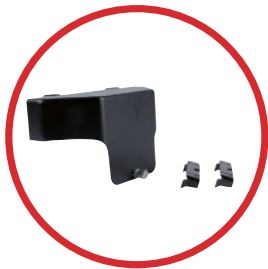
BPAK Backpack adapter kit