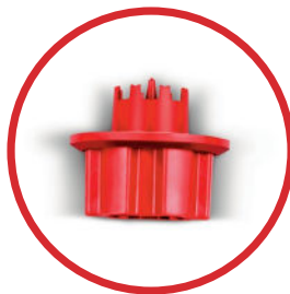
TCM-X Installation Tool Hole saw and driver