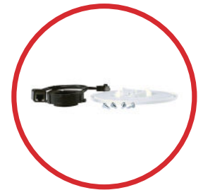
TCM-X-DK Plenum attachment for drywall ceilings