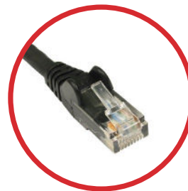
C5E-10-P, C5E-25-P 10ft and 25ft pre-terminated plenum rated Cat 5e cables