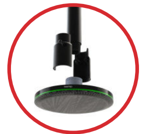
TCM-X-PM Pole Mount Solution