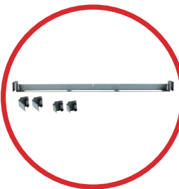
TB-1 Tile bridge for TCM plenum boxes