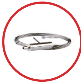
Seismic Cable Adapter Cable adapter for TCM plenum boxes